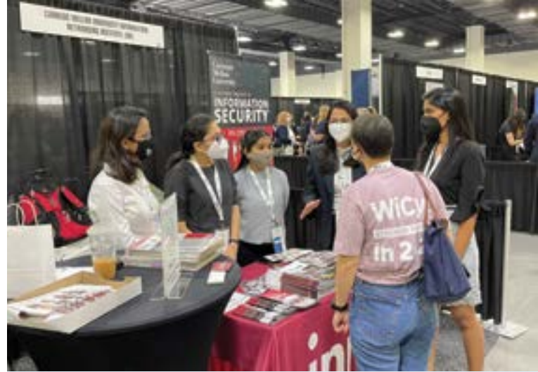
INI students greet visitors at the booth at the WiCyS conference in Denver last fall.