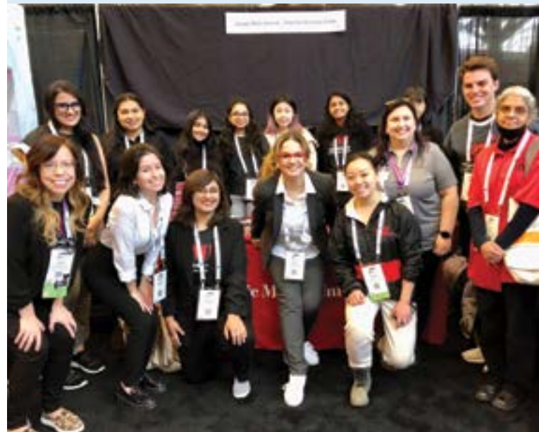
INI students, staff and faculty attend the WiCyS 2022 conference in Cleveland last spring.